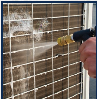
Fine or wide spray

to wash even the dirtiest coils, without damaging sensitive fins. And the small portable size lets you clean coils from the front or back of the coil – a proven method for increasing coil cleaning and system efficiency. CoilJet makes cleaning coils quick and easy. Now that's smart.